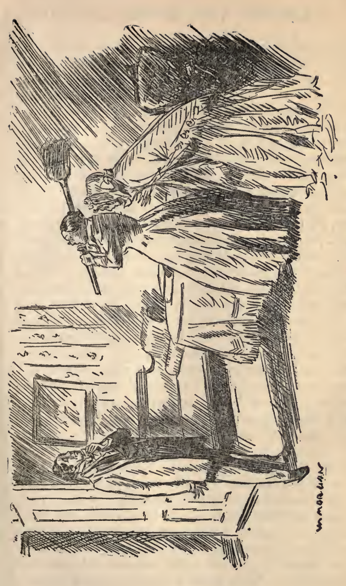
"'I'm-I'm sure I beg your pardon, ladies,' he stammered."